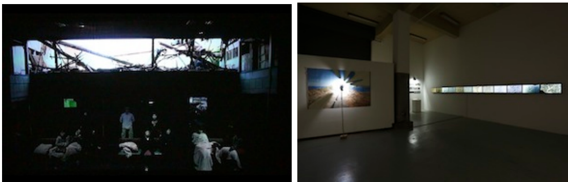
left : "Site Consuming Shadow", MORI Museum, Fukushima/Japan right : "Re : Eyes on Hand", SNOW Contemporary, Tokyo/Japan